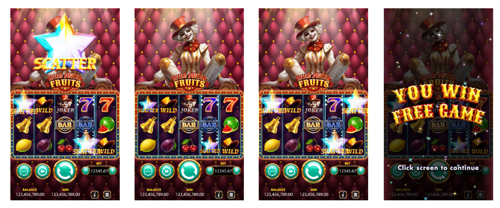
\cdot 3 or more SCATTER symbols will trigger the Free Game.