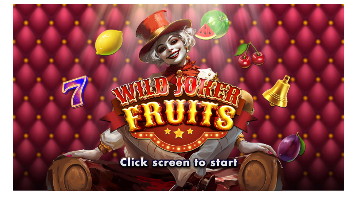
For PC, Laptop and Tablet version